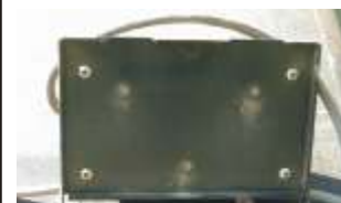
Yield monitor sensor in an open position. This sensor has 3 photo detectors.