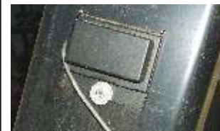
Yield monitor sensor in a closed position mounted on the front of a chute.