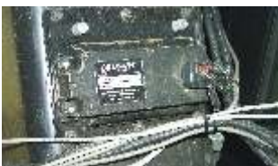
Yield monitor sensor in a closed position mounted on the front of a chute.