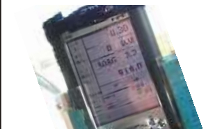
User interface – Compaq iPAQ®.