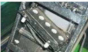
Yield monitor sensor in an open position. This sensor has 5 photo detectors.