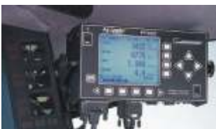
User interface – PF3000.